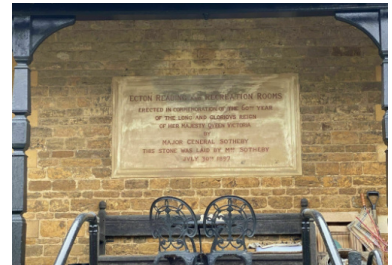
Photo challenge. I wonder if this family is related to the famous Sotherby's Auction House in London?

4. Cross the road and turn left to head down the hill. Best to keep on the pavement for the moment.