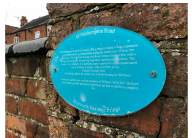
Photo Challenge. Take a minute to read the plaque at 49 Northampton Road and I hope it gives you a laugh.

1b Checkpoint photo: Cross Spratton Road.