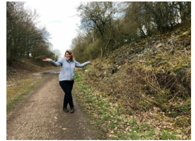
Photo Challenge. Geocache time! Can you find it? Clue: Valley of the rocks... This is a clever geocache and is hidden to the right, in a hole and is shaped like a rock! Please remember to place it back in the same spot after you have signed the log book. Visit geocaching.com for more info.

4. When you see the concrete carriers you have now reached Brampton Valley Way (an old railway line). If you fancy a drink / pub spot then turn left, if not then continue your walk by turning right. You will stay on the Brampton Valley Way for approximately 1.9 miles.