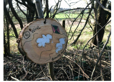
Photo Challenge. Can you spot the Muddy Boots & Books Challenge along this route? For more information visit: https://muddybootsandbooks.co.uk/