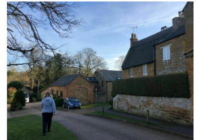
Photo challenge. As you head down the road, can you spot the thatch art on top of the cottage? We can't decide if it is a boar, hog or lion. What do you think? Continue down this road.

7e Cross the road and head towards the village stocks, then look up to your right to spot the photo challenge in the next photo!