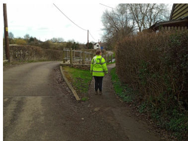
PHOTO CHALLENGE: The second photo challenge (Hobbit House) is 180 yds from the junction on your right.

4d. After the Hobbit House, take the footpath on the right for a pleasant stroll alongside the stream.