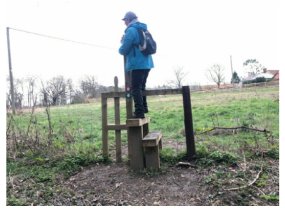
PHOTO CHALLENGE: Can you see the chickens and you will soon see a rookery (if you look up before the next stile).

6h. Climb the stile, cross the road and then go over the stile on the other side of the road. You will now follow a trail through the fabulous wooded area.