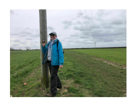
PHOTO CHALLENGE. At the telegraph pole see if you can find the geocache which is hidden under a stone at the base of the pole. Sign the log book, and then place the cache back where you found it, ready for the next person.

6d. At the gap in the hedge turn right through the gap then head straight towards the telegraph pole in the middle of the field.