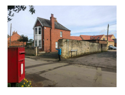
PHOTO CHALLENGE!! Turn left and see if you can spot the "stain glass piggy window". This route also has numerous historic houses with green plaques.

3c. At the end of the cul-de-sac turn left and follow the green footpath sign.